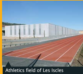
Athletics field of Les Iscles

The decision to pass or fail a student is made by the International School management in compliance with regulations issued by the French Ministry of Education. Students that do not meet the conditions required to move up to the next grade may be accepted to repeat their school year.