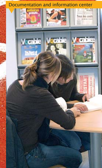
Documentation and information center