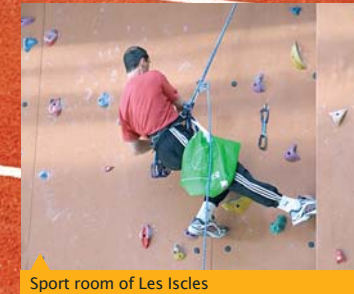
Sport room of Les Iscles